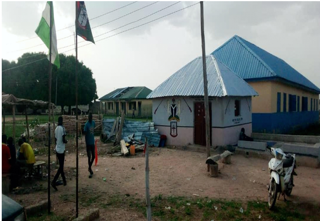
Plate 4: Local Security (Vigilante/Yanbanga) Post built by the community

To mitigate the inadequacy of hospital/maternity services in the community, the community resorted to alternative medicine to complement the dysfunctional primary health centre. Besides, indigenes were allowed to make use of the acquired university land for farming on a temporary basis for a small fee. Thus, unemployed youth were kept engaged, thus mitigating their natural and financial vulnerabilities. Another curative approach adopted by the university on traffic was the introduction of road signs and speed bumps/breakers around the university gate. The university and GK community vigorously involved her staff and local vigilante in controlling traffic and ensuring proper parking around university gate area. Moreover, the school management was in constant dialogue with real estate investors as well as AEDC and telecommunication network providers as part of efforts to provide stable services to tackle physical and human vulnerabilities.