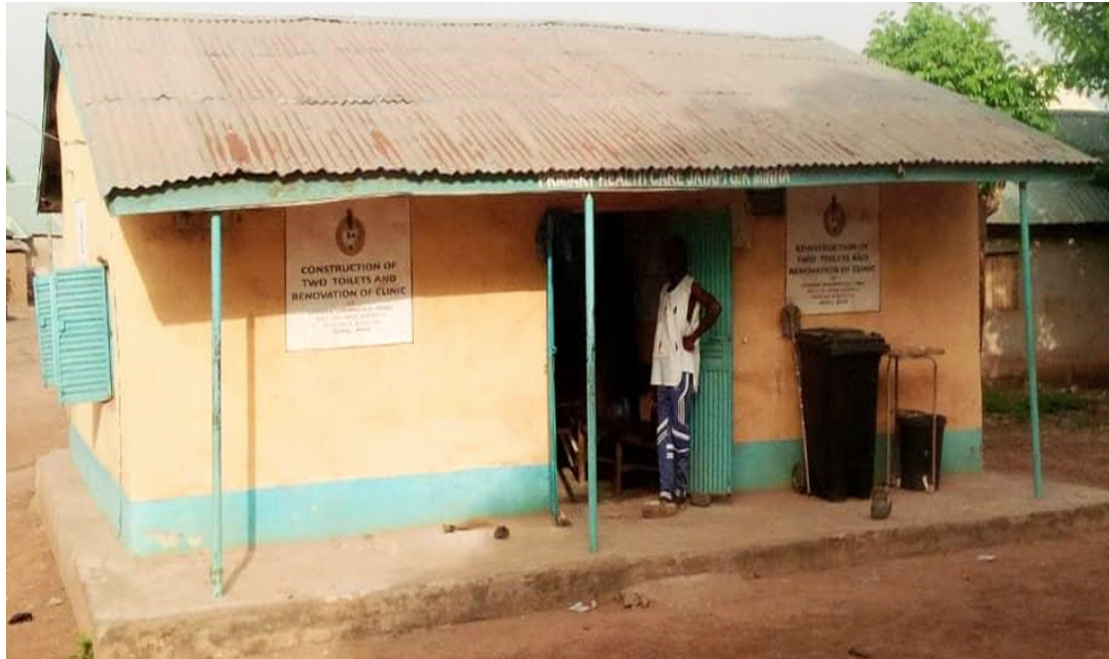
Plate 2: The only health centre in Gidan Kwano