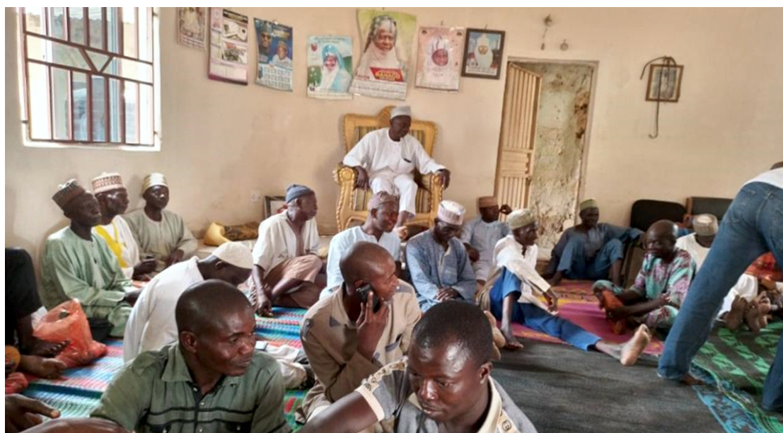
Plate 1: Stakeholders' meeting at the Dagaci's Palace

The study further found that the establishment of the university led to changes in the design, quality and type of buildings in the community, given the preferences of migrants. The income levels of some families have also risen, as property owners rented out extra rooms while others sold part of their land. The presence of students in the community has also boosted business while influencing the lifestyle of youthful indigenes who would have ordinarily been content to remain on the farm. On the negative side of things, many poor elderly farmers and youths lost their land but were not found to be employable by the university owing to their low academic background. Inevitably, this led to a serious impact on family spending, thus exposing the community to financial hazards.