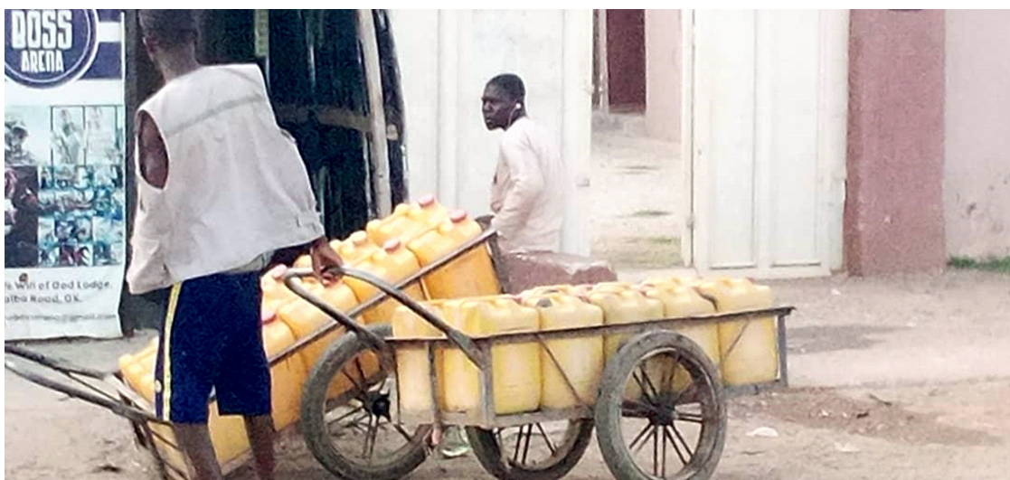
Plate 3: Water Vendors ( mai ruwa ) supplying water to Gidan Kwano residents

Social Asset vulnerability was also considered by respondents as a risk factor, ranking third with an RII of 2.3189 and a mean score of 899. However, it was observed that the change in the social asset of the community has slightly improved the literacy rate/knowledge of GK residents, particularly that of the youths, owing to improvement in educational services in GK. Despite the merit of the urbanising rate of GK, all previous resilience efforts were hampered by rigid cultural inclinations as manifested in the ineffective application and adjustment of the recommended resilience actions heightened by inefficient institutional support mechanisms. This finding agrees with Nuhu (2011), who asserted that a vivacious affiliation exists between man and land as entrenched in the African society's dynamic culture. Furthermore, cases of crimes due to improved social factors orchestrated by migrants and others outside GK have been on the increase and have a negative impact.